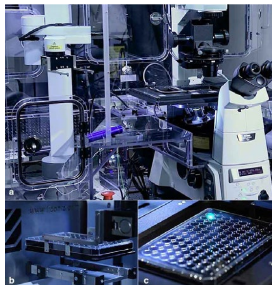
Figure 1 | Current robotic microscope design using a Nikon Ti-E inverted microscope. Future system designs utilizing the Nikon Ti2-E can potentially double the throughput of comparable systems. (a–c) Nikon Ti-E inverted microscope integrated with a robotic wellplate loader (a) for moving samples from incubator (b) to microscope stage (c). The system displayed in this figure belongs to the Finkbeiner laboratory.

Nikon Instruments Inc., Melville, New York, USA. Correspondence should be addressed to jrallen@nikon.net.