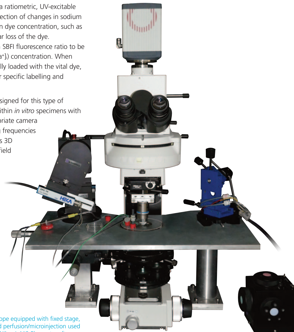
Figure 1. Nikon's FN1 microscope equipped with fixed stage, digital camera (Orca Flash 4) and perfusion/microinjection used in conjunction with Nikon's NIS-Elements software.

In conjunction with this microscope, which is equipped for cellular imaging of ion transients, Nikon's NIS-Elements software serves as a simple interface for photo-documentation which combines powerful image acquisition, visualisation and analysis of data (Figure 1).